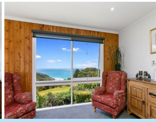
80 Leorkes Access Wongarra, VIC