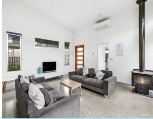
2/5 Purnell Street Anglesea, VIC